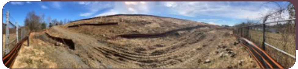
Panoramic images demonstrating the transformation of Phase I along the northwestern edge of Gude Landfill from top to bottom November 16, 2022, January 20, 2023, and February 24, 2023