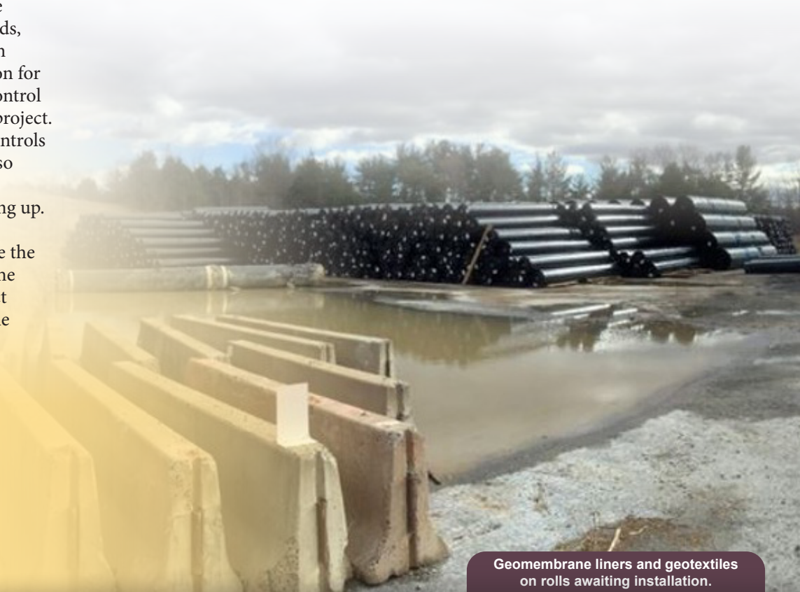
Geomembrane liners and geotextiles on rolls awaiting installation.