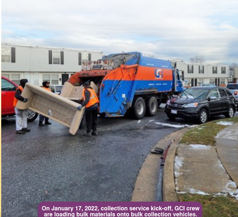
On January 17, 2022, collection service kick-off, GCI crew are loading bulk materials onto bulk collection vehicles.