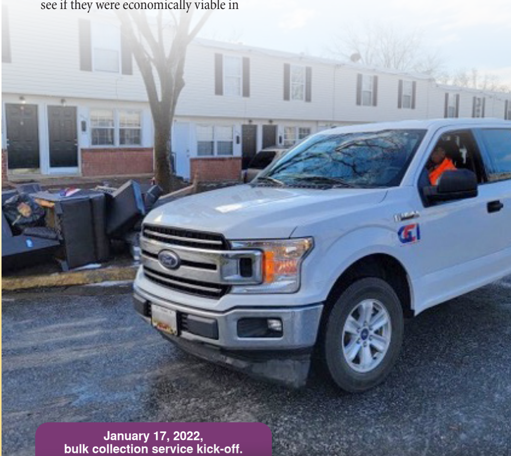
January 17, 2022, bulk collection service kick-off.

The County encompasses approximately 682 square miles of territory with a County road network of approximately 3,352 miles of roadways, with more than 243,000 individual residential units that qualify for Service Area Bulk Material Collection and Special Collection.