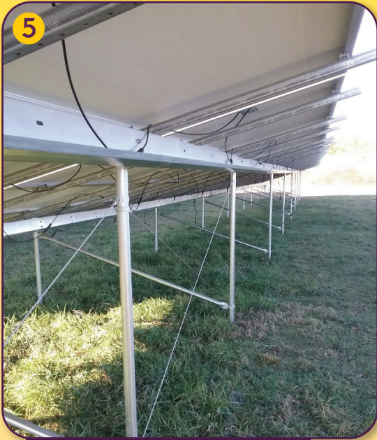
Under side of the panels, showing the connected wiring. (01.17.2020)