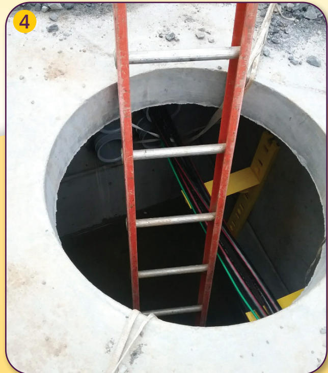
Manhole showing the cabling (medium voltage power and communications). (01.10.2020)