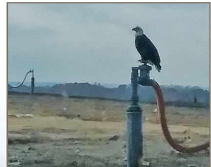
Bald eagle on a landfill gas well head.

gas total, which can vary due to gas quality and ambient temperatures. The excess gas, about 1,500 scfm extra, is burned in one of three on-site flares.