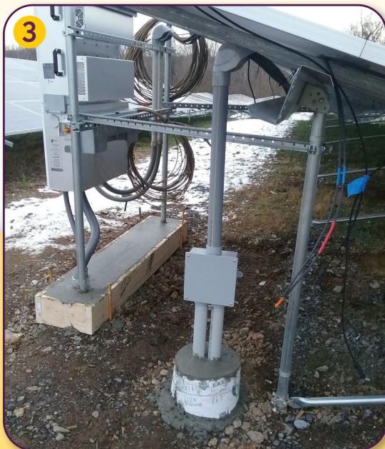
Side view of the solar array, showing the inverter, cabling, and mow strips in forms. (01.10.2020)