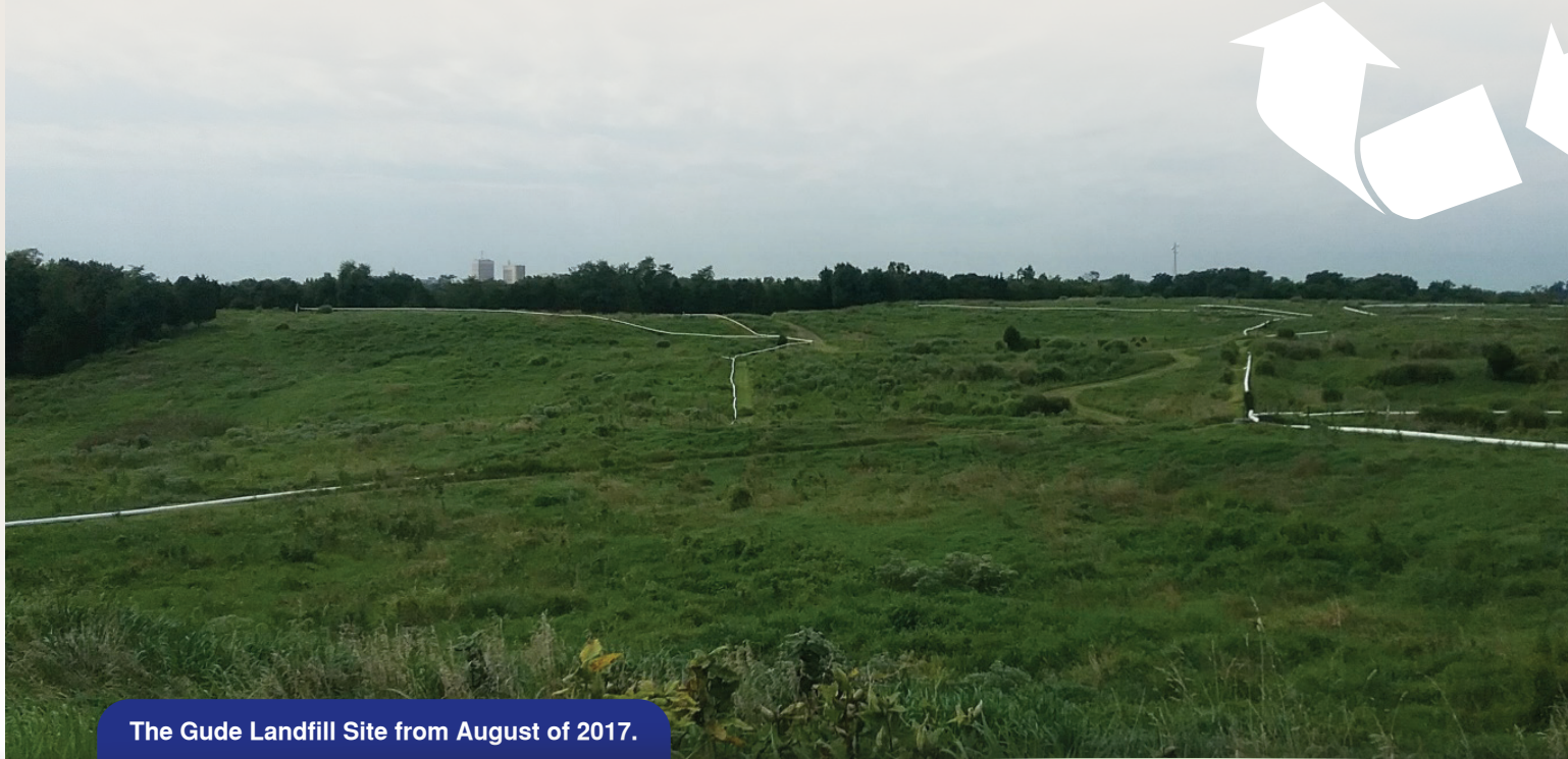
The Gude Landfill Site from August of 2017.