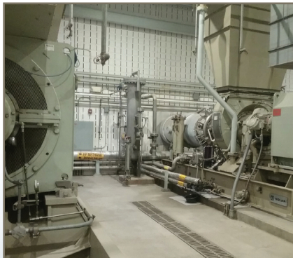
Turbines at the landfill gas-to-energy facility.