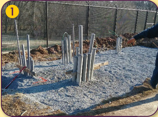
BESS Pad with conduit stub-ups before concrete pour. (12.20.19)