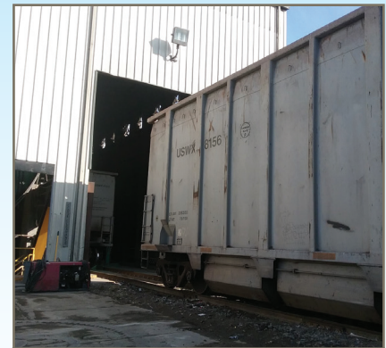
Railcar of waste arriving, awaiting its turn to be emptied onto the tipping floor.

Landfill gas from the site is collected, through 330 wells across the landfill, and is then sent to the landfill gas-to-energy facility which utilizes four turbines to generate and export approximately 9.5 megawatts of electricity to the local electric distribution system or grid, in addition to powering the buildings located on-site. Another turbine is being considered. The turbines consume an estimated 6,000 standard cubic feet per minute (scfm, an industry standard for the measurement of gas flow) of landfill