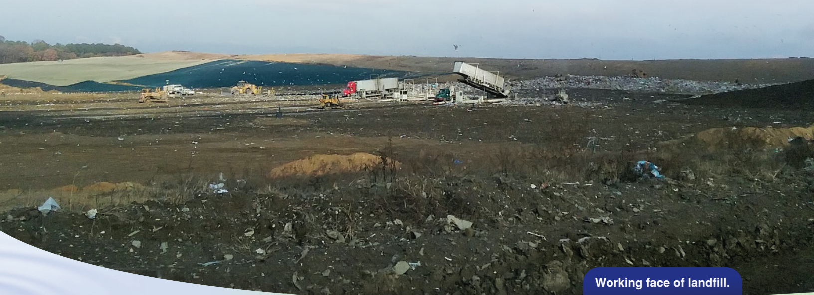
Working face of landfill.