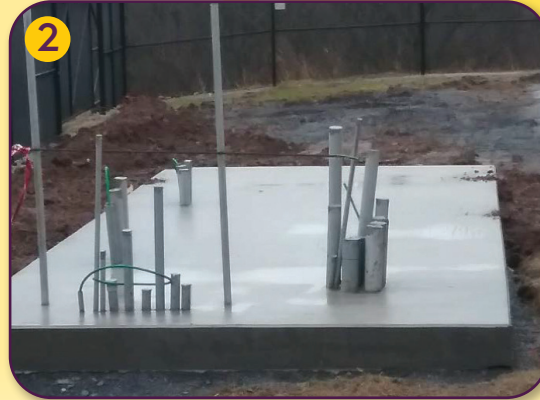
BESS Pad with conduit stub-ups after concrete pour. (01.03.2020)