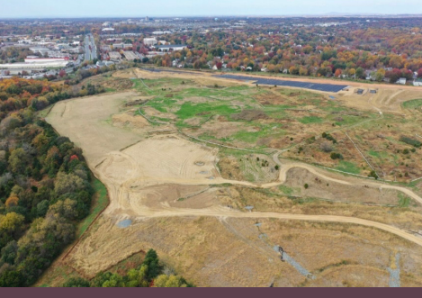
Phase III after geosynthetic liner placement and Phase V before disturbance from October 2023

information, please contact the Authority or visit the County's project website at <a href="https://www.montgomery-countymd.gov/DEP/trash-recycling/facilities/gude-landfill/remediation-project.html">https://www.montgomery-countymd.gov/DEP/trash-recycling/facilities/gude-landfill/remediation-project.html</a>