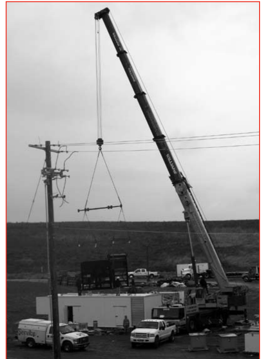
March 2009- Radiator is installed on the roof of the engine at Oaks Landfill.

This summer Montgomery County will open landfill gas to energy facilities at the Oaks and Gude Landfills. SCS Engineers began construction of the facilities in November 2008 and upon completion, the facilities together will produce 3.2 megawatts of renewable energy. The construction of the facility at Gude landfill was delayed due to the winter weather and freezing; however the Oaks facility construction is progressing and beginning to take on its final form. The largely anticipated “crane day” occurred at the Oaks Facility in early March and the Caterpillar and Jenbacher engines, switchgear and other auxiliary equipment to process landfill gas and generate electricity were placed on concrete pads. The primary critical path items for the remaining work at each site include the Pepco and Verizon wiring and equipment configuration approvals.